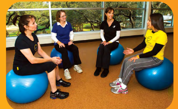
Giving cancer survivors and their families a place to heal