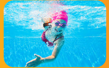
Teaching kids life-saving swim skills to prevent accidental drowning deaths