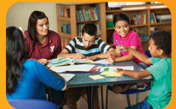
Ensuring kids have the things they need to succeed in school and life