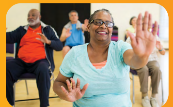
Educating our community about obesity and chronic disease prevention

Visit tampaymca.org for details on how to get involved in the cause!