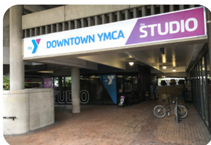
Downtown YMCA Fort Brooke 104 South Franklin St., Tampa, FL 33602 813.229.1305